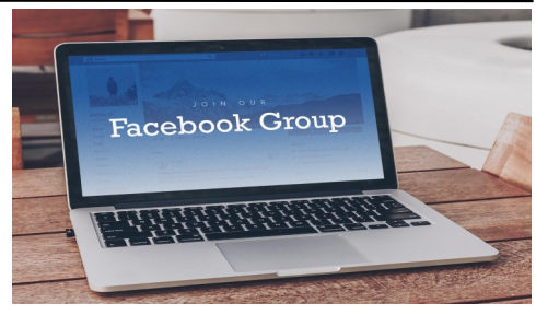
"Like" us on Facebook!

I am excited about this new system and believe it will greatly benefit our ministry and provide a safer environment for the families we serve.