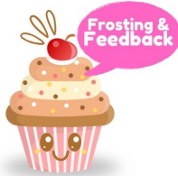
Baking Up a Better Ministry

To support families in guiding their children toward meaningful worship, we are giving away a free copy of Parenting in the Pew to all families with kids or grandkids in the FirstKids Ministry!